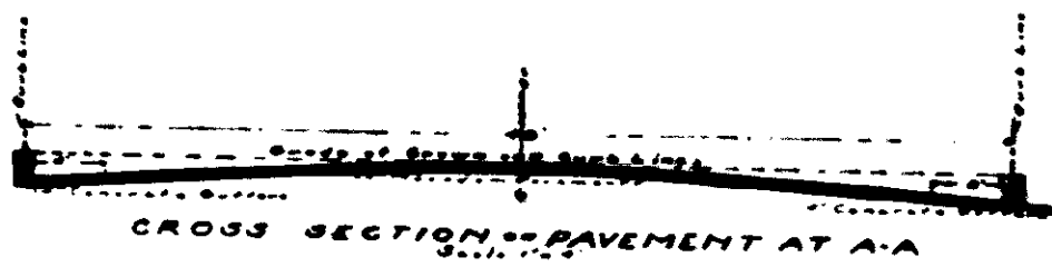
CROSS SECTION OF PAVEMENT AT A-A

LEGEND ceh [Symbol: Dotted pattern] Existing Pavement [Symbol: Solid black] Concrete Gutter [Symbol: Dashed line] Center Line [Symbol: Solid line] Property Line